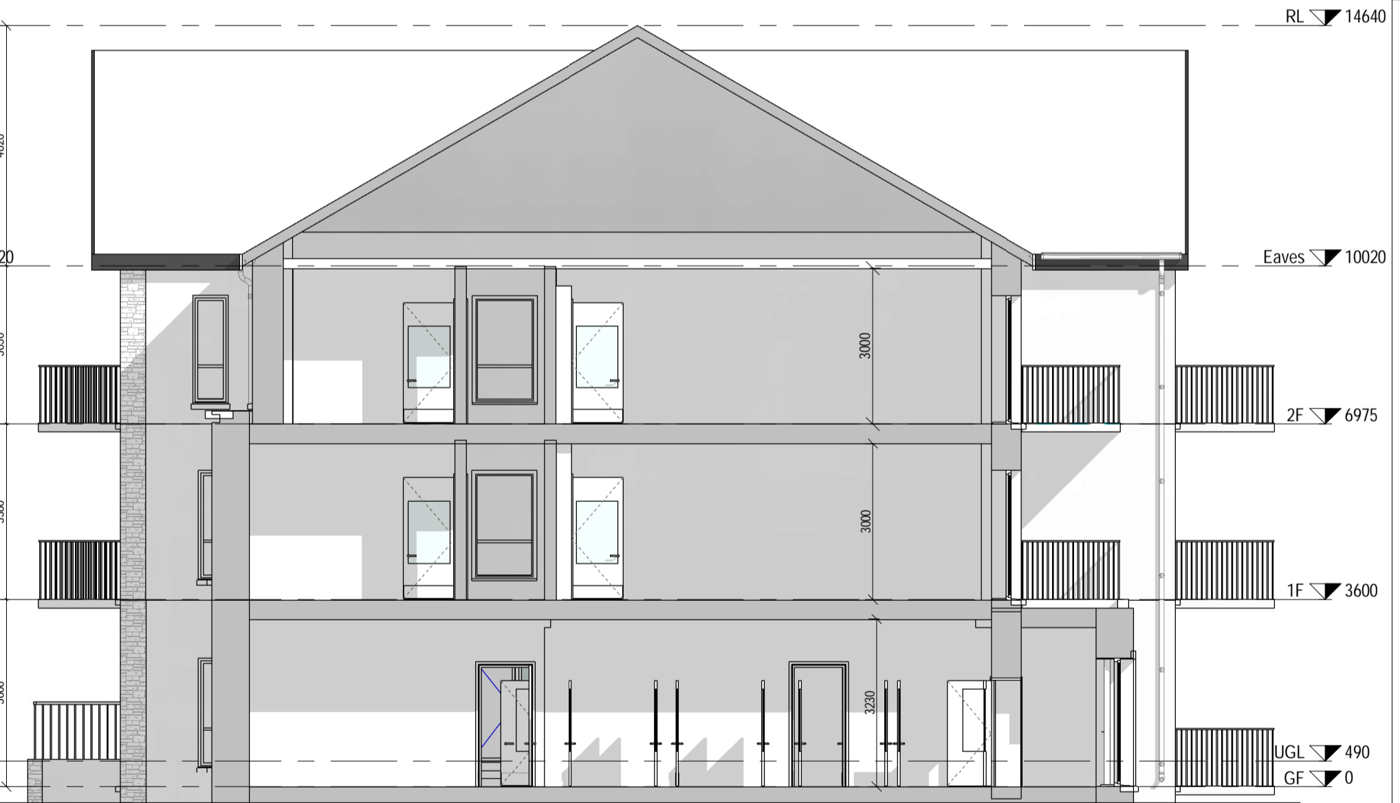
5 Section A-A 1:100