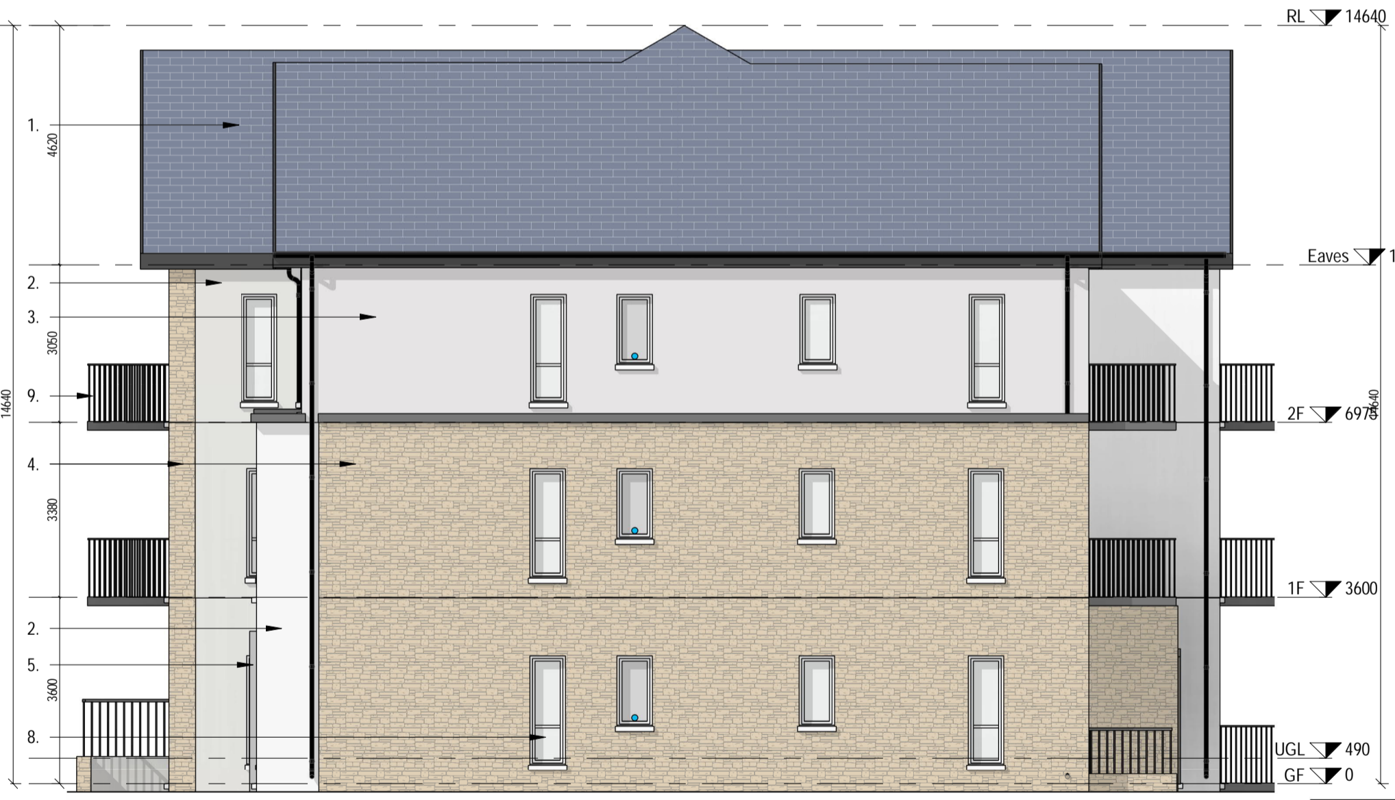
4 Elevation 4 1:100