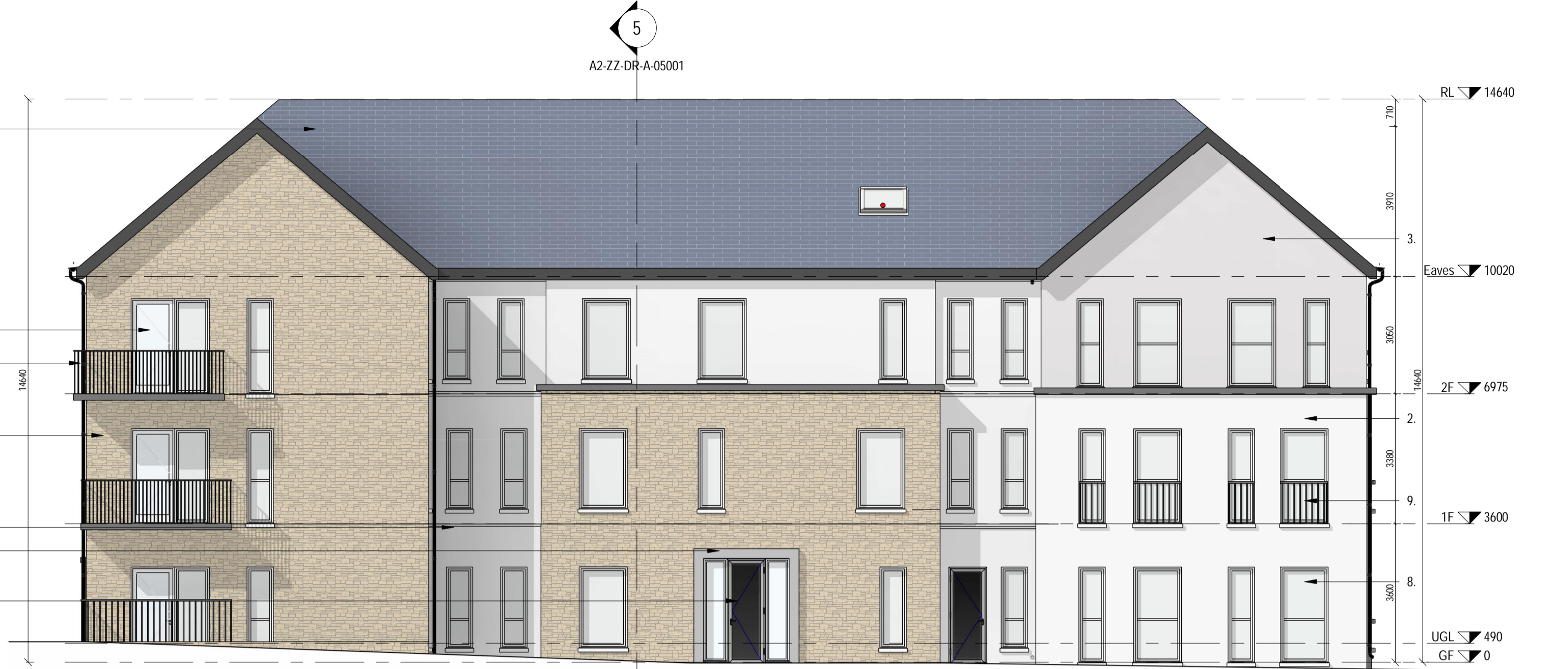
2 Elevation 2 1:100