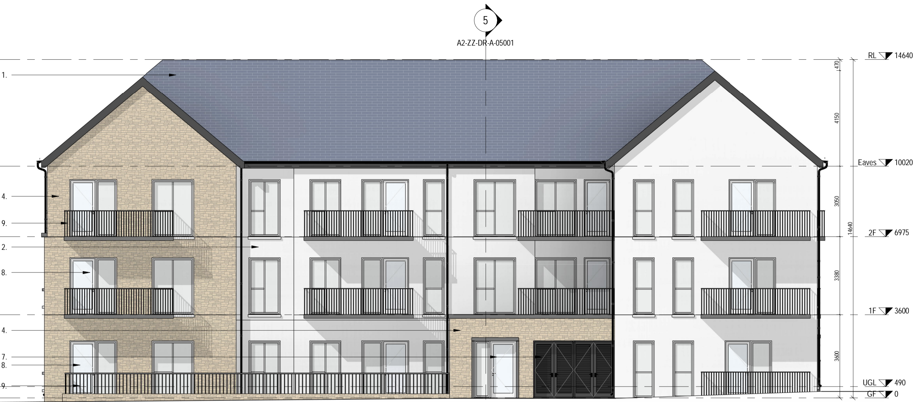
1 Elevation 1 1:100