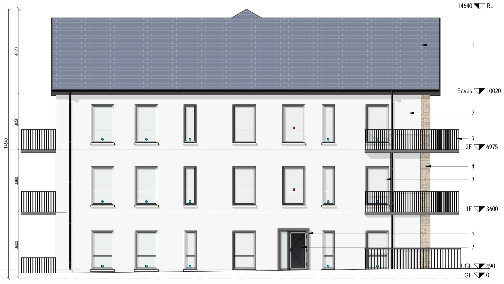
3 Elevation 3 1:100